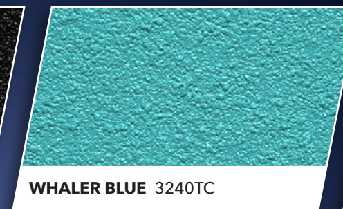
WHALER BLUE 3240TC