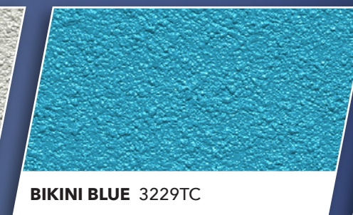
BIKINI BLUE 3229TC