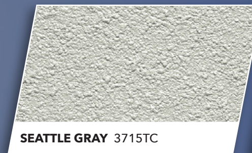
SEATTLE GRAY 3715TC