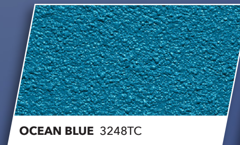
OCEAN BLUE 3248TC