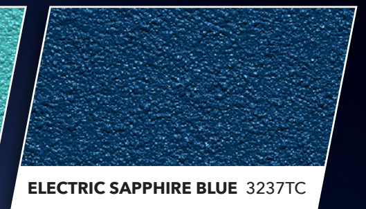
ELECTRIC SAPPHIRE BLUE 3237TC