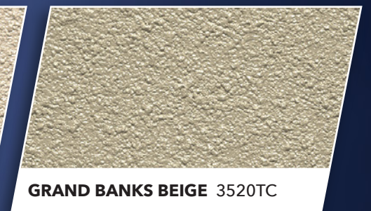
GRAND BANKS BEIGE 3520TC