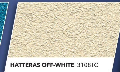
HATTERAS OFF-WHITE 3108TC