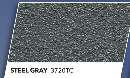
STEEL GRAY 3720TC