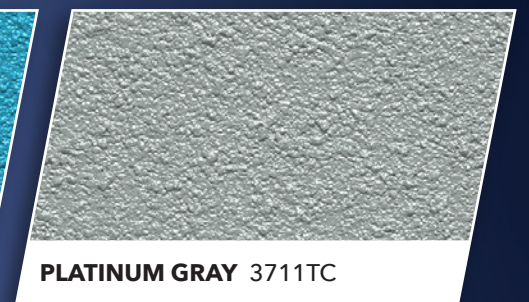
PLATINUM GRAY 3711TC