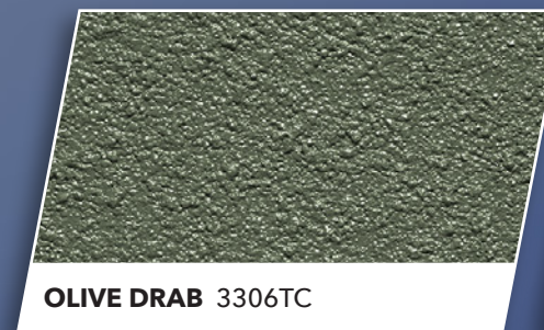
OLIVE DRAB 3306TC