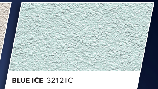
BLUE ICE 3212TC