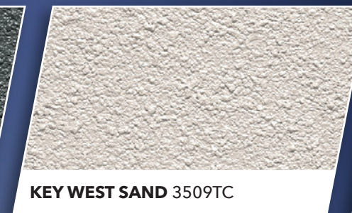
KEY WEST SAND 3509TC